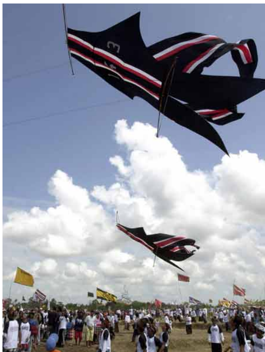
SANUR: Balinese people watch flying traditional kites during the Bali Kite Festival on Friday.