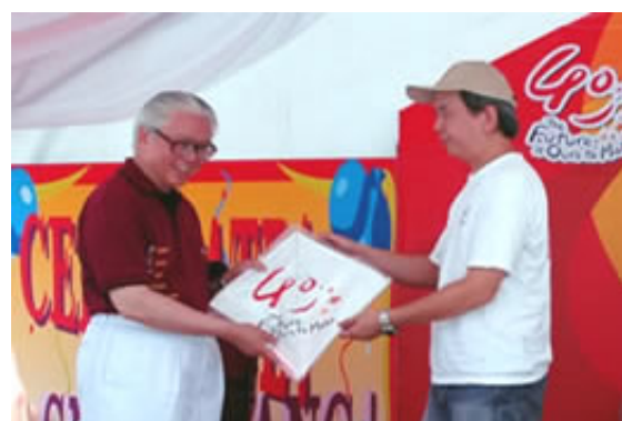
A token hand-painted kite was presented to Dr Tony Tan by the SKA President

SKA was there to showcase a range of kites and to facilitate the Kite Painting and Making Competitions.