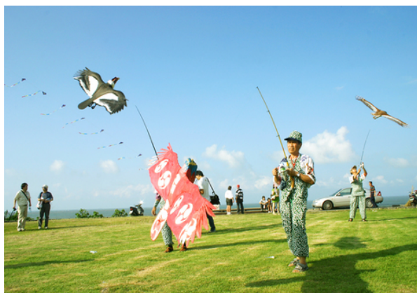
On your marks, get set, fly.

By Derek Lee STAFF REPORTER (The Taipei Times) Friday, Sep 16, 2005, Page 15