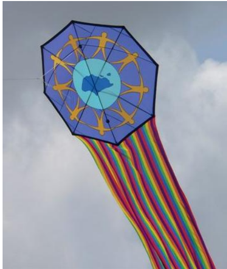
Gadis built this kite for the festival