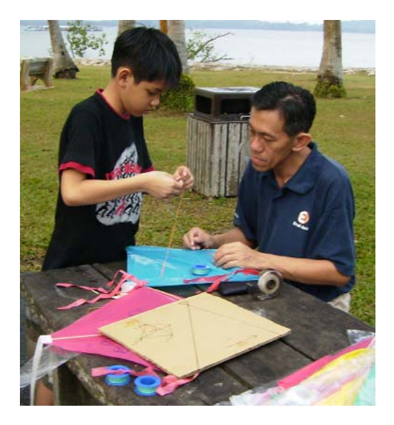
August 26, 2006 - A group of 10 families from the BNI group gathered at Pasir Ris Park for a kite-making session.