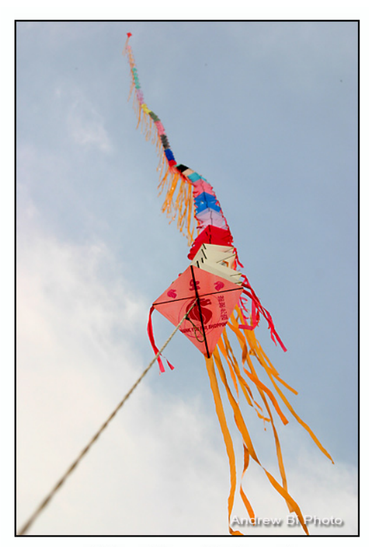
West Coast Park 2006

July 23, 2006 – Kites were flying at West Coast Park in conjunction with READ! Singapore 2006 campaign and promotion of the book The Kite Runner.