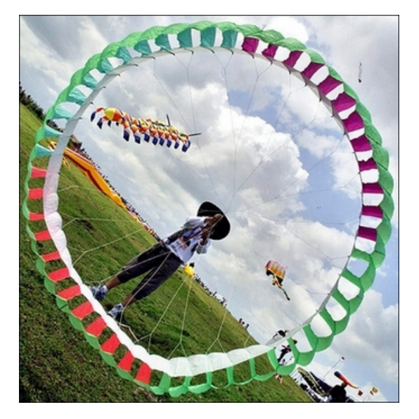
Let's go fly a kite : A participant from the Philippines prepares his kite during the Bali International Kite festival in Tanah Lot.

A contestant from Bandung, west Java ,prepare a kite shape like pedicab at the International Kite Festival in Jakarta on August 20, 2006. Twenty two provinces in Indonesia and eleven countries including Malaysia, Netherland,