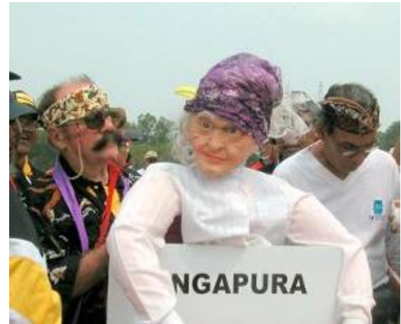
Opah Terbang made her debut in Pasir Gudang.

Opah Terbang or Flying Grandmother is a re-enactment of an event that took place in 1844, over 160 years ago. Dr. Colladon, a Swiss gentleman and early kite inventor, watched his brother-in-law send flowers and fruit up the kiteline on a parachute. Dr Colladon decided to send up something more spectacular – he made a lifesize dummy of a lady sitting in a chair with an umbrella.