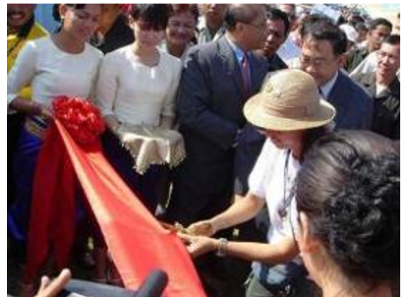
Gadis at the ribbon-cutting ceremony