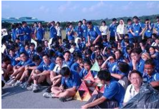
Students waiting to fly their kites