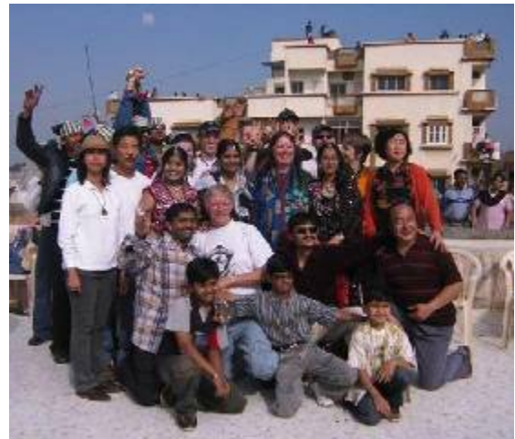
Kite-flying on rooftops

As the one looks out over the skyline of Ahmedabad, or any other city of Gujarat one cannot fail to experience a lifting of the spirit, and a lightening of mood as one witnesses a sea of fluctuating colours as small kites dart in all directions against a clear blue backdrop."