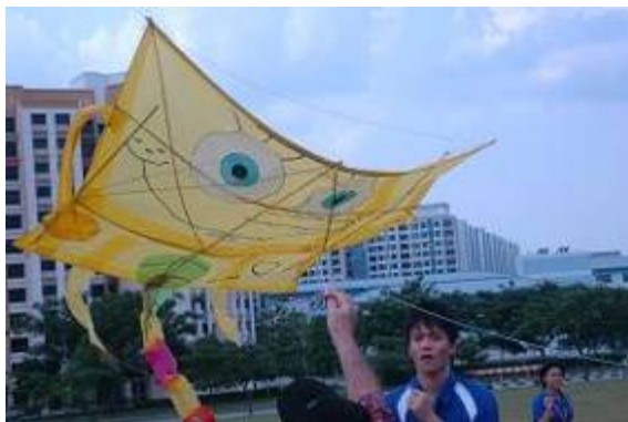
Not quite asymmetrical but nevertheless, an excellent kite