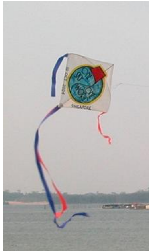
Flying for world peace